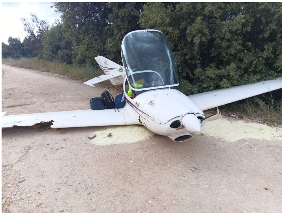
Image 2 - aircraft after the accident

After the 33 planes landed properly, they saw that an accident had occurred where the plane veered to the left of runway 10. The plane came to rest on a gravel road that runs parallel to the runway. In doing so, he seriously injured a cyclist and slightly injured two pedestrians who were on the mentioned gravel road at the time. The pilot of the plane, a French citizen, did not suffer any injuries, and the passenger on the plane, also a French citizen, suffered minor physical injuries.